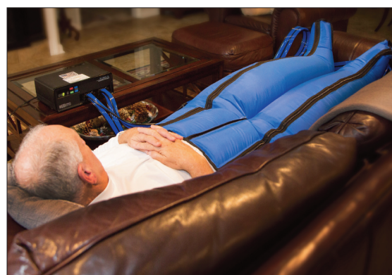
16-chamber Bio Pants treats groin, buttock and abdomen

Bio Compression Systems is the only company in the world that manufactures custom arm and/or leg sleeves for patients having special needs.