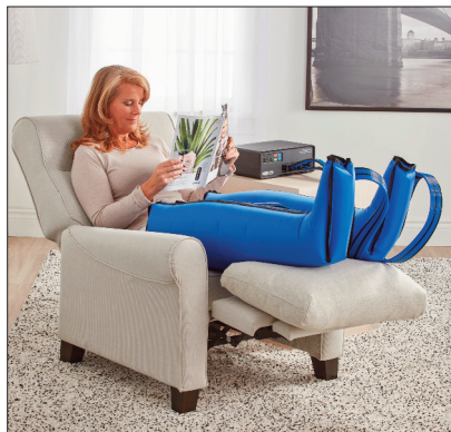
Bi-lateral 8-chamber leg sleeves