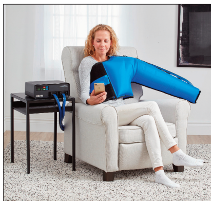
8-chamber arm and shoulder sleeve