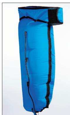
Custom amputee sleeve